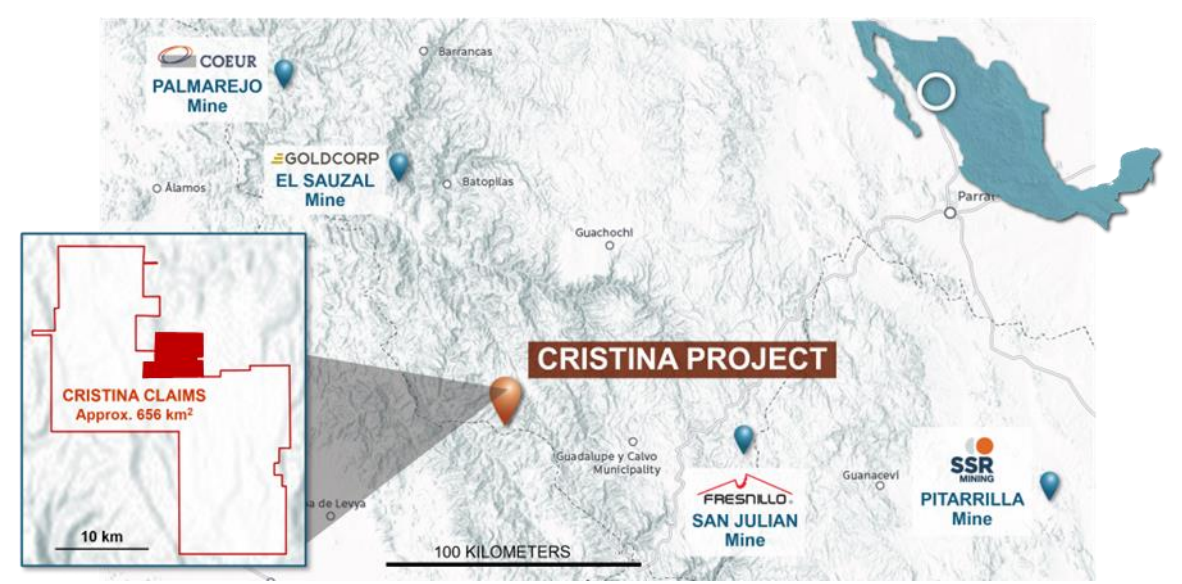
Figure 1- Location map